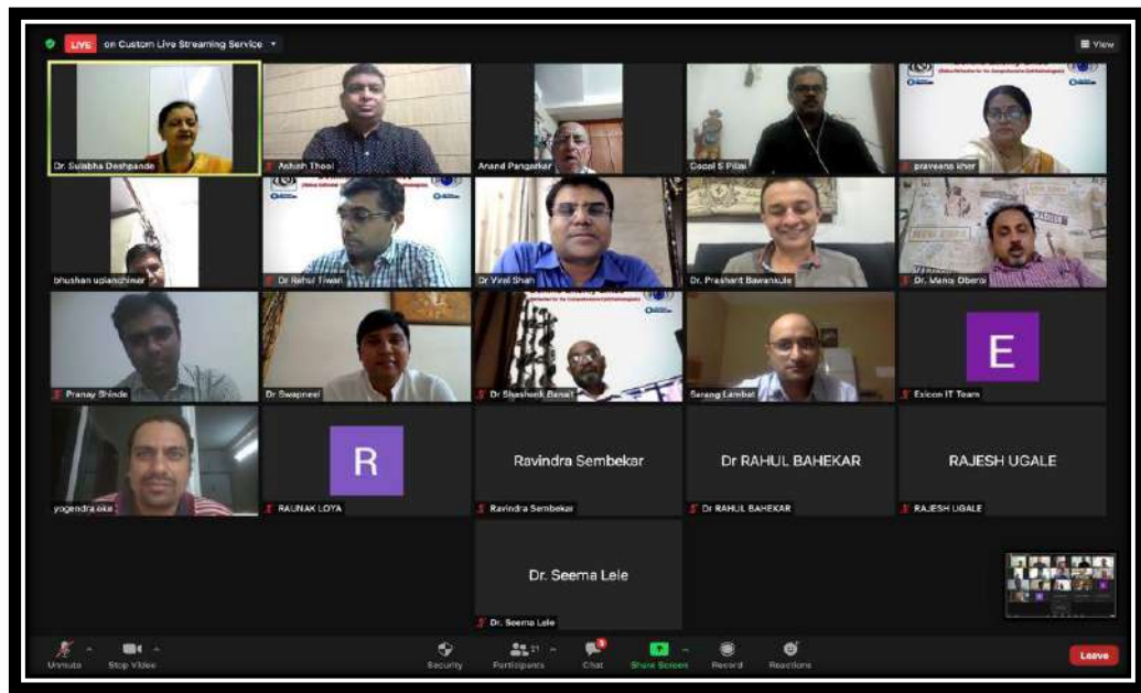
Webinar-Behind the enemy lines – Retina refresher for the comprehensive Ophthalmologists