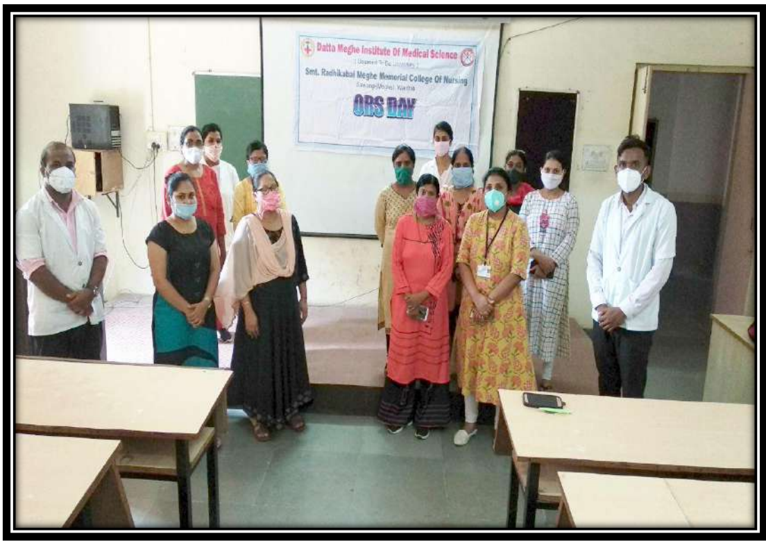
Celebration of World ORS Day 2020