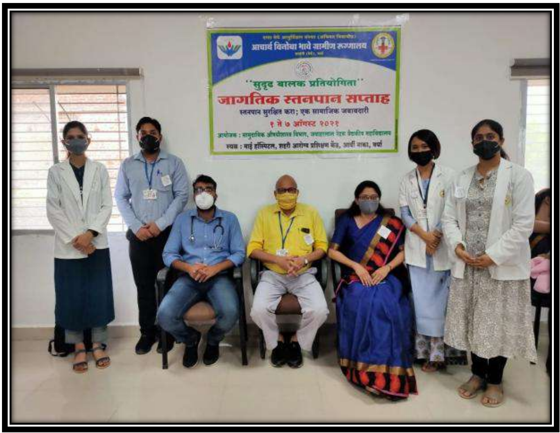
Celebration of Breastfeeding Week 2020